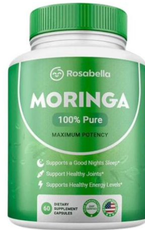
Rosabella brand moringa powder capsules distributed by Ambrosia brands, LLC.