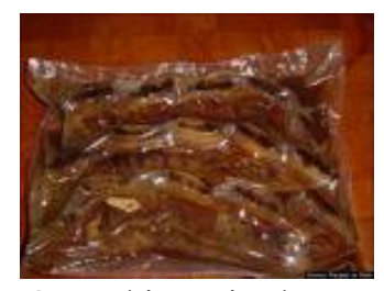
Sous Vide packaging